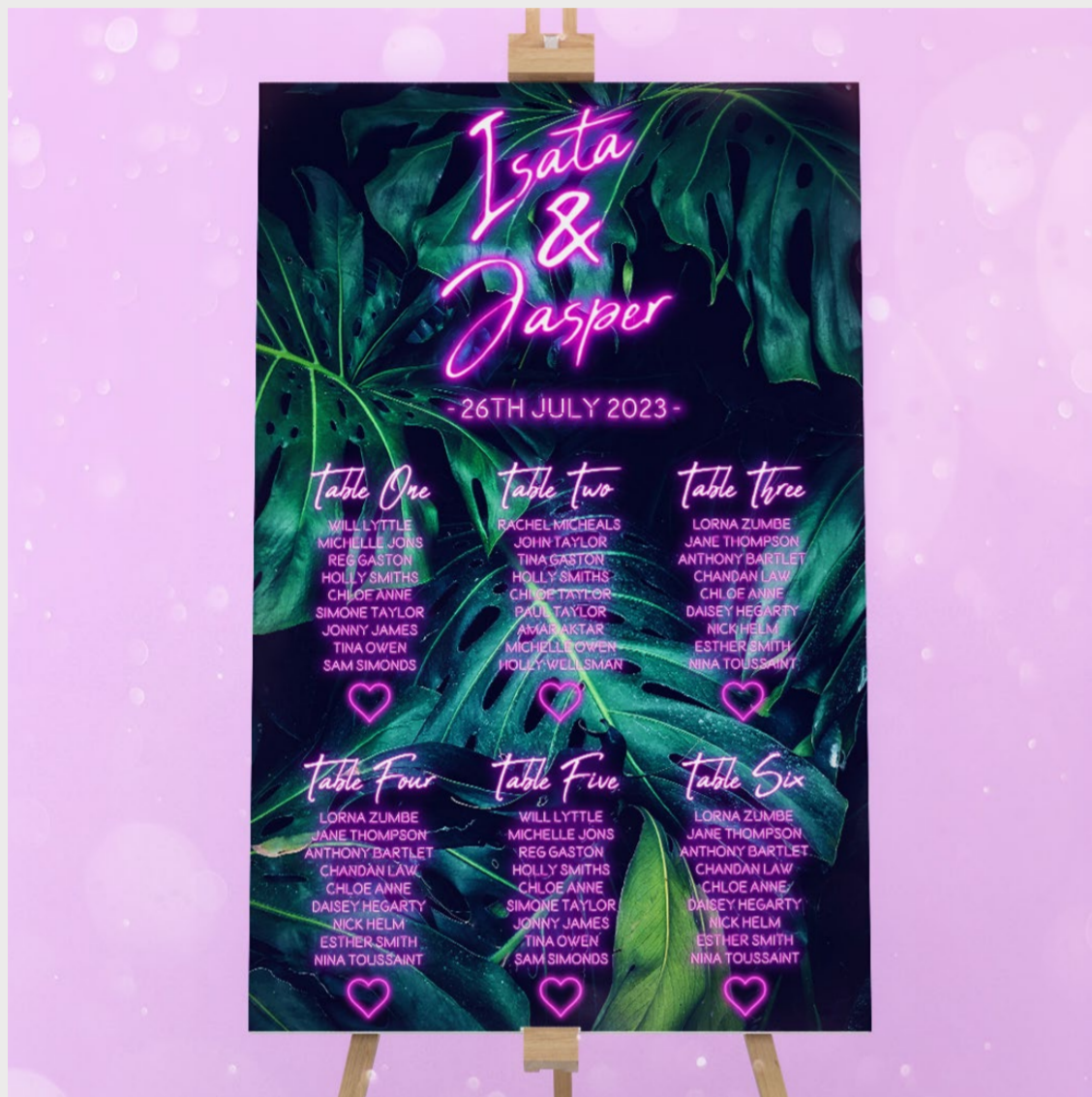
TABLE PLANS & ORDER OF THE DAY BOARDS

On-the-day stationery is designed to match all of my off-the-peg Invites & Save The Dates (or your custom design if you've had one) so your wedding theme can run throughout your whole day.